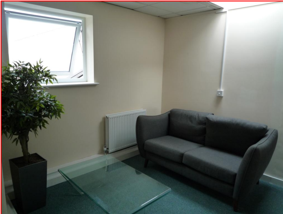
Above showing break out area