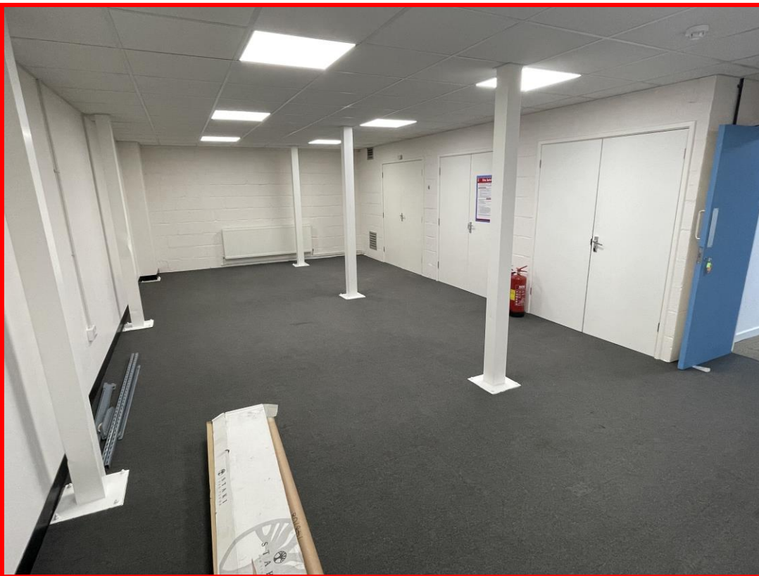
Internal Store Room