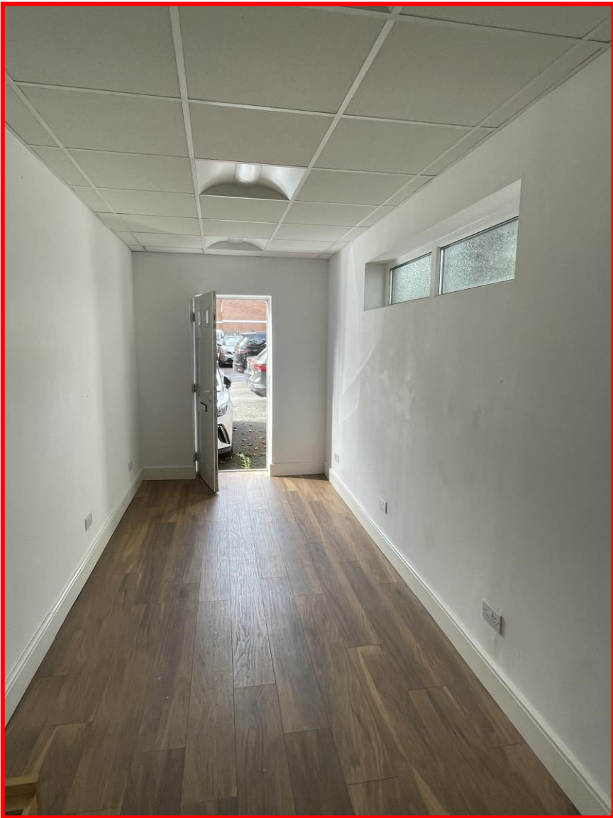
STUDIO 6 ABOVE & STUDIO 7 BELOW