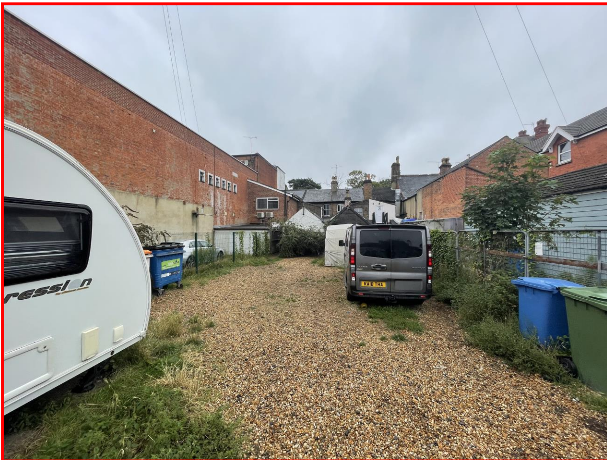
Rear Elevation Showing Car Park

A two storey Victorian era terrace double shop (two shops knocked through) with extensive storage and a large 2/3 bedroom first floor self-contained flat and a large rear private car park extending to around 1,900 ft 2 . The premises will benefit from some refurbishment.