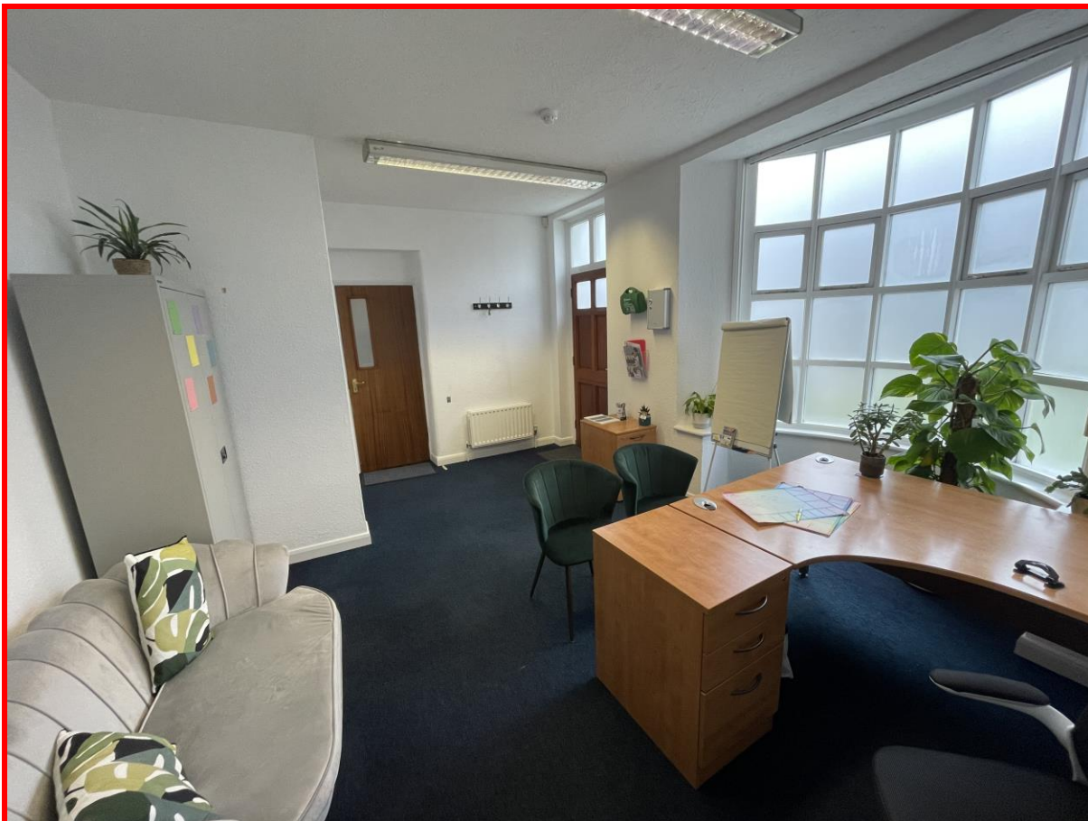
Picture showing Suite 1B

LEASE Available on new lease terms by agreement, please note that if a lease is taken beyond 3 years, then there will be an upwards only open market rent review at the end of the third year.