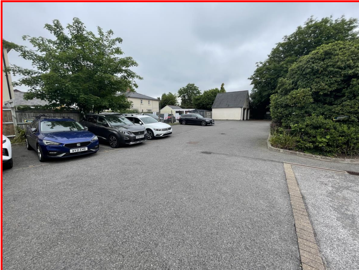
Large rear car park

Suites 1B & 1C are 2 ground floor office suites which benefit from gas heating by radiators, carpeting, shared kitchen and toilet facilities, access to broadband fibre cabling and allocated parking spaces set within the large rear private car park.